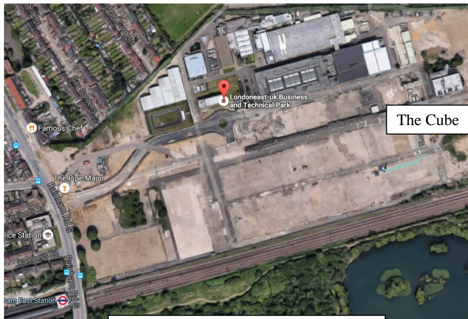
Dagenham East Tube station